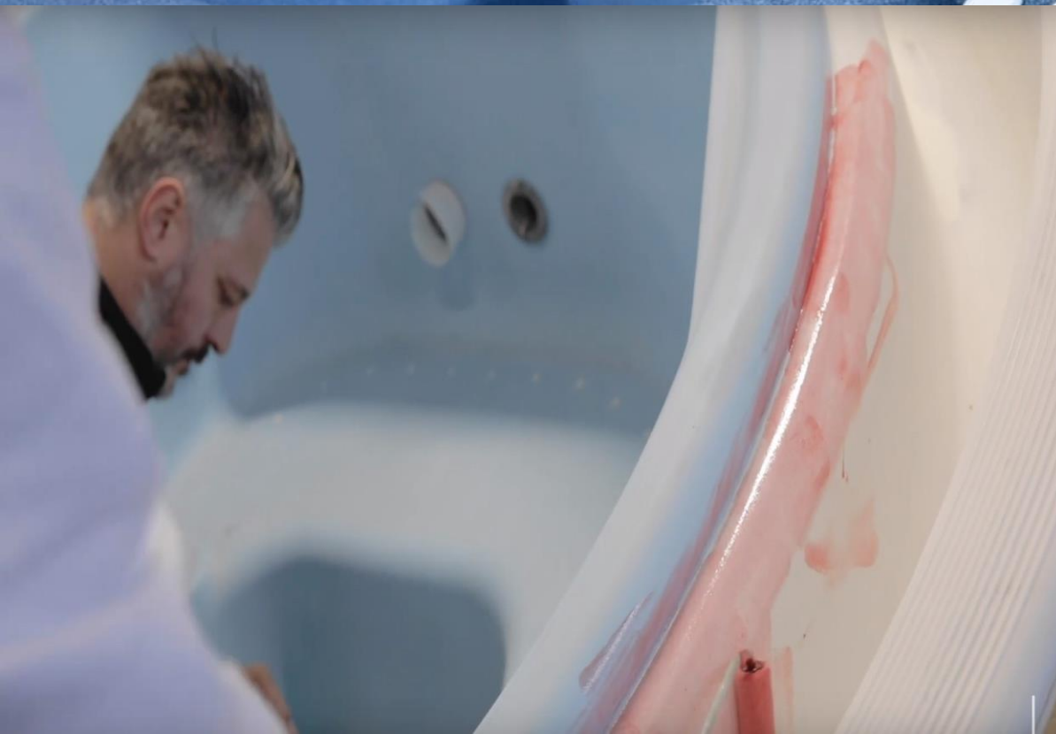
Laying of primer